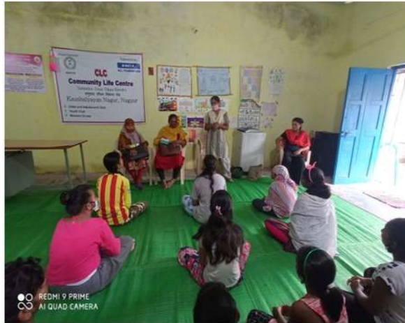
Health Awareness Workshop