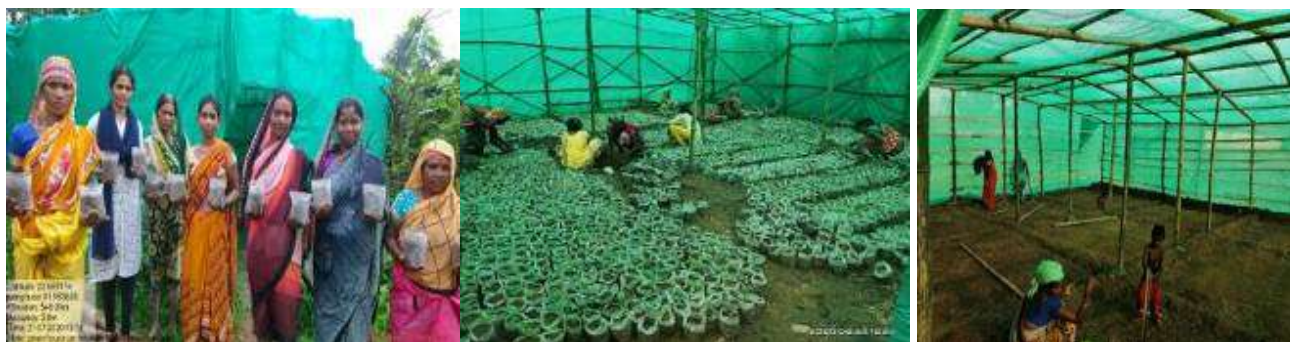
Greenhouse in Bhandi village