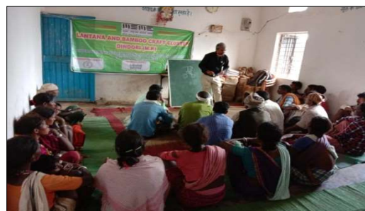
Glimpses from the cluster;