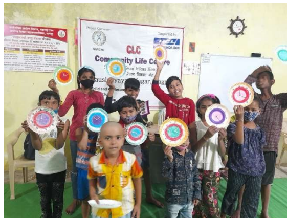
Recreational Activity - Drawing & Painting