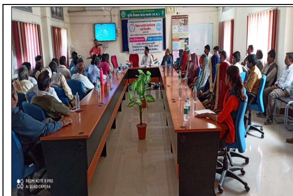
District level workshop at KVK Sagar