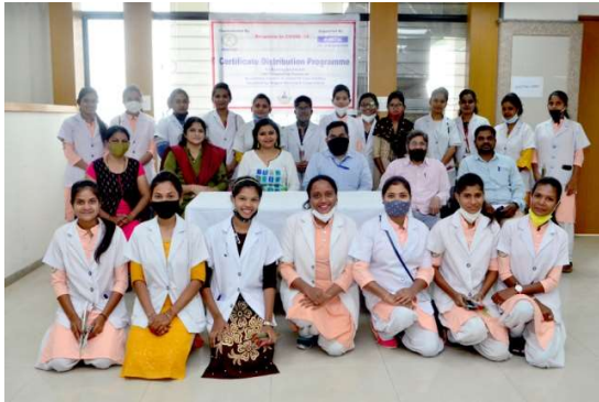
Youth took training in Health Care Trade also were placed in Covid Care Centre & Quarantine Centers operated by NMC