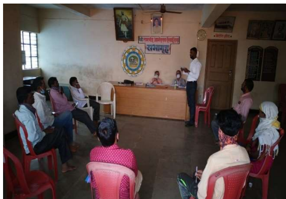
Training and Capacity Building program of BODs