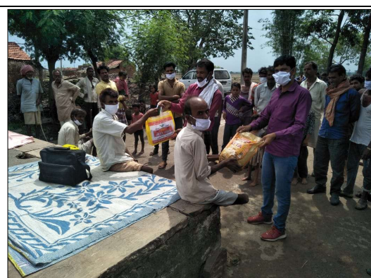
Ration and Seed distribution program