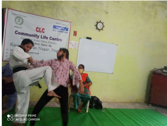
Self Defense Awareness & Training