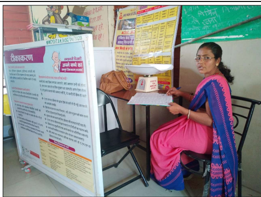
Vaccination Station at AW Centre

Children are using sports material at Safe play space