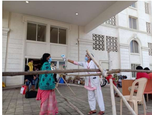
Trained Health Care beneficiaries provided services at Covid Care Centres & Quarantine Centres operated by NMC