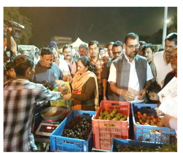
Producer to Consumer Market