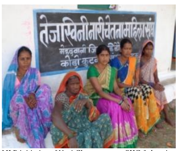
MLP initiative of Nari Chetna women SHG federation at Mehendwani block of Dindori (MP)