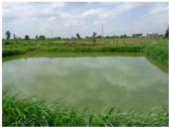
Farm Pond in Ghatanji, Maharashtra