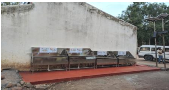
Hand Wash Station at Vadfali Ashram School, Dist. Nandurbar