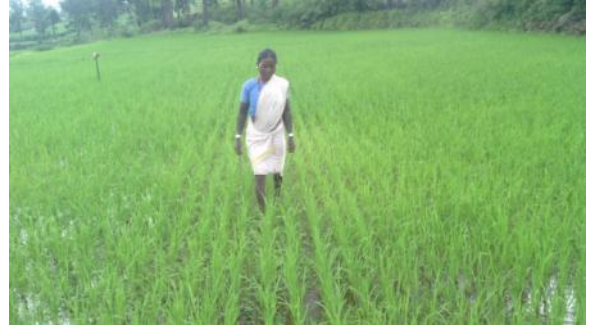
Line sowing in Paddy field, Baiga Chak