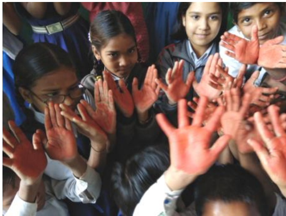
Red Hand Day Celebration, 14 Feb 2018