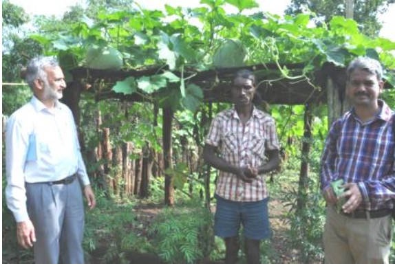
Vegetable farming, Baiga Chak