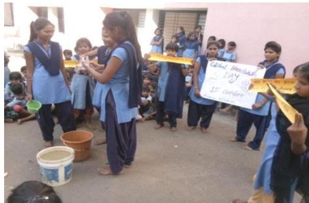
Global Hand Wash Day, Mandavi Ashram School, Dist. Nandurbar