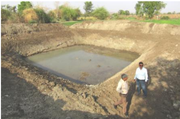
Farm Pond, Ghatanji