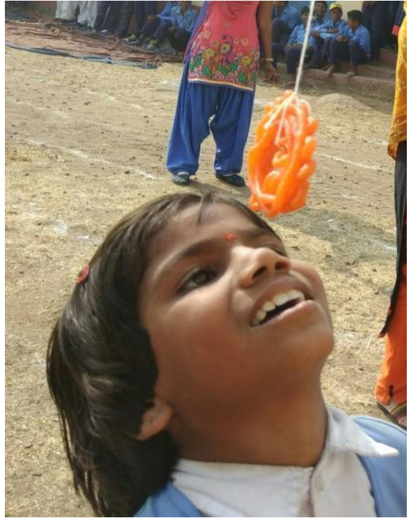
Sports & Fun with Children