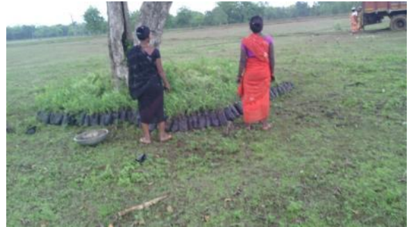
Saplings for Plantation