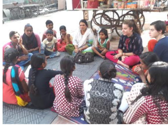
Chat with Children