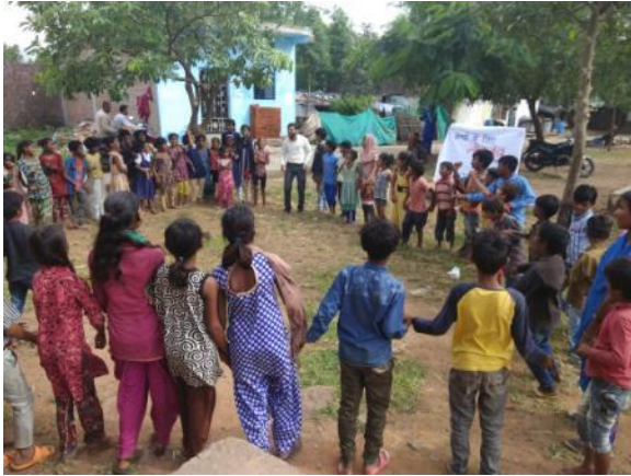
Play time with Children