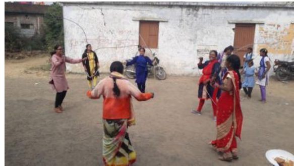
Promoting Women in Sports